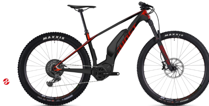
LECTOR 6.7+ TITANIUM GRAY / BIOT RED / STAR WHITE