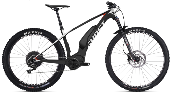
LECTOR 5.7+ TITANIUM GRAY / STAR WHITE / BIOT RED